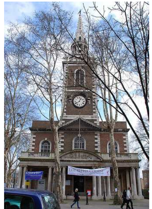
St Mary's Church, Upper Street, Islington. The entrance to the Crypt is on the left side of the church.